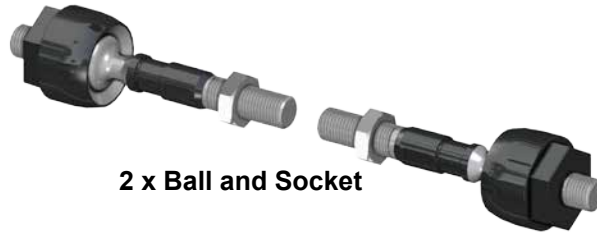
2 x Ball and Socket