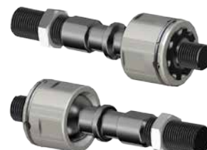
Ball and Sockets