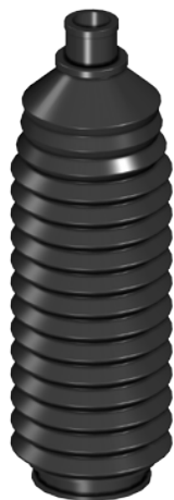
Boot x 2