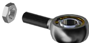
Tie Rod End x 2